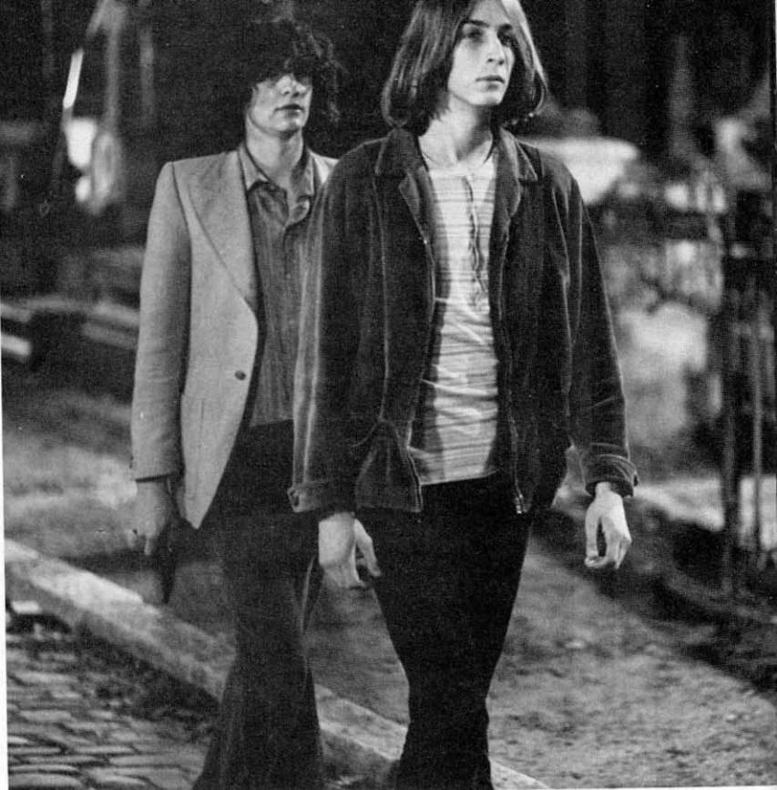
Charles and his assassin in the graveyard.

The interview indicates something quite different. Bresson was earnest, sincere, hospitable; he continually struggled to make his thoughts clear. Yet there was never the rapport I had hoped for. His answers were not in tune with my questions, or my questions with his answers. It felt as if each idea was fighting to assert itself through a fog of misunderstanding. Perhaps this distance was due to the peculiar nature of a first meeting, or perhaps it was a by-product of the barriers of age, culture, and language. But more likely it was because Bresson cannot (or will not) un-